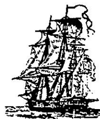
Arrived on ship Angel Gabriel Pemaquid, Mass (Now Maine) August 14, 1635 Settled at Ipswich, Mass.